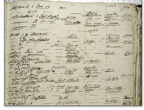
Page no. 15 with events listed chronologically